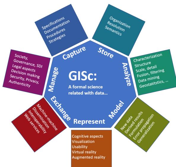
Figure 3. Illustration of the different main actions involved in GISc definition and some examples of the particular ones. Own elaboration.

Definition of Geographic Information Science: "Geographic Information Science is a formal science that studies the methods to capture, store, analyze, model, represent, exchange and manage N-dimensional spatial data" .