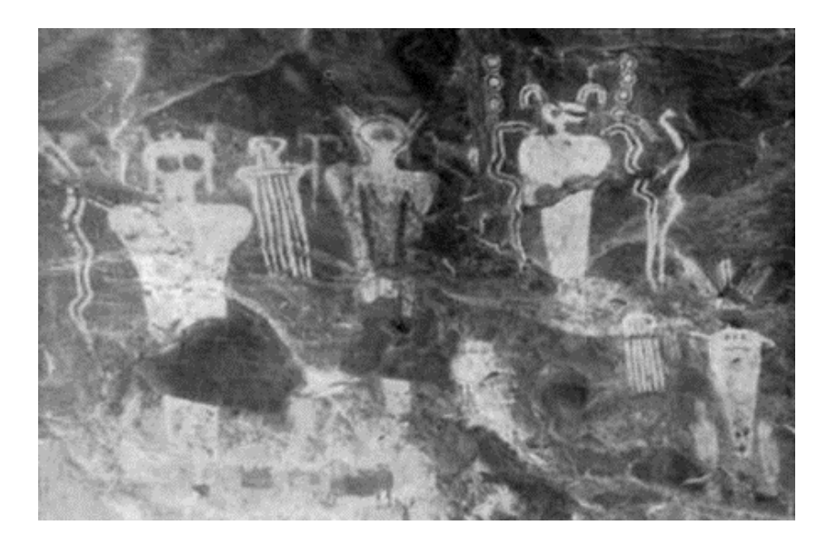
Figure 2. Pictograph from Utah, USA, from Gough, G. R. (2007).

Figure 1. Pictograph from Utah, USA, from Gough, G. R. (2007).